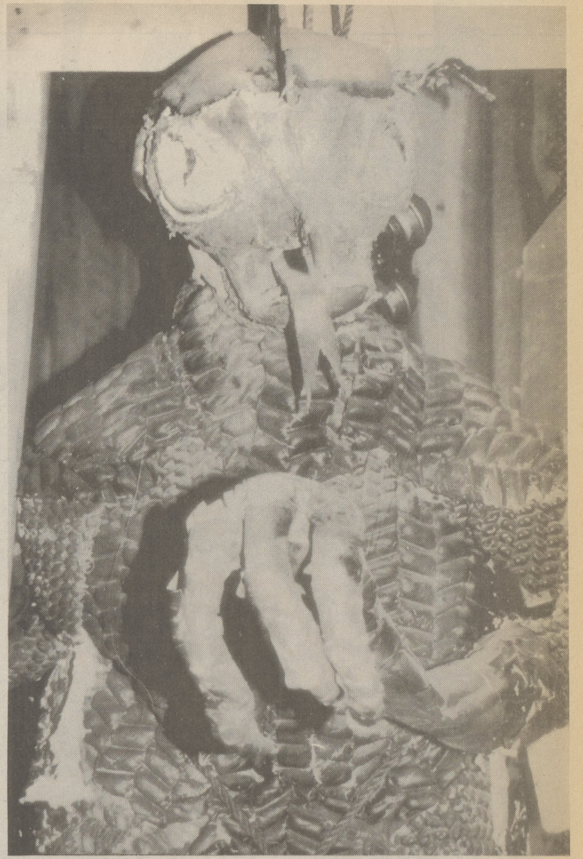
"GREEN MONSTER" - One of the Lehman Haunted Barn's oldest attractions.

Call the Lehman spook line: (717) 675-1216 for further updates on the Lehman haunted barn ghost busting.