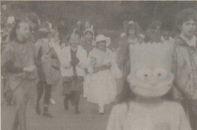
ON PARADE - Participants in last year's Halloween Parade in Dallas walked down Lake Street after showing off their costumes for judges.

The Halloween Parade is sponsored by the Dallas Kiwanis Club. Judging will be done by members of the club, the Women of Kiwanis and Circle K members from Penn State Wilkes-Barre. In the event of rain, the parade will be held indoors at the Dallas Elementary School on Hildebrandt Road.