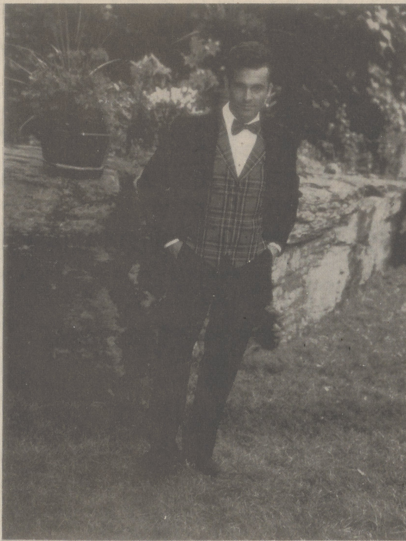
Dapper grooms want distinctive details for their wedding day clothes. Shown, tuxedo with plaid vest and bow tie.

Shoulders are softer, fabrics are sensual to the touch, the lines are easy on the eye, the fit is less stuffy than traditional English formal