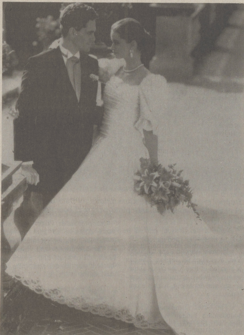
Sweet and romantic details are the hallmarks of this year's bridal gowns. Shown, gown with Marie Antoinette sleeves from After Six Bridal Collection.

The newest shoes are midheeled slingbacks with straps and cutout