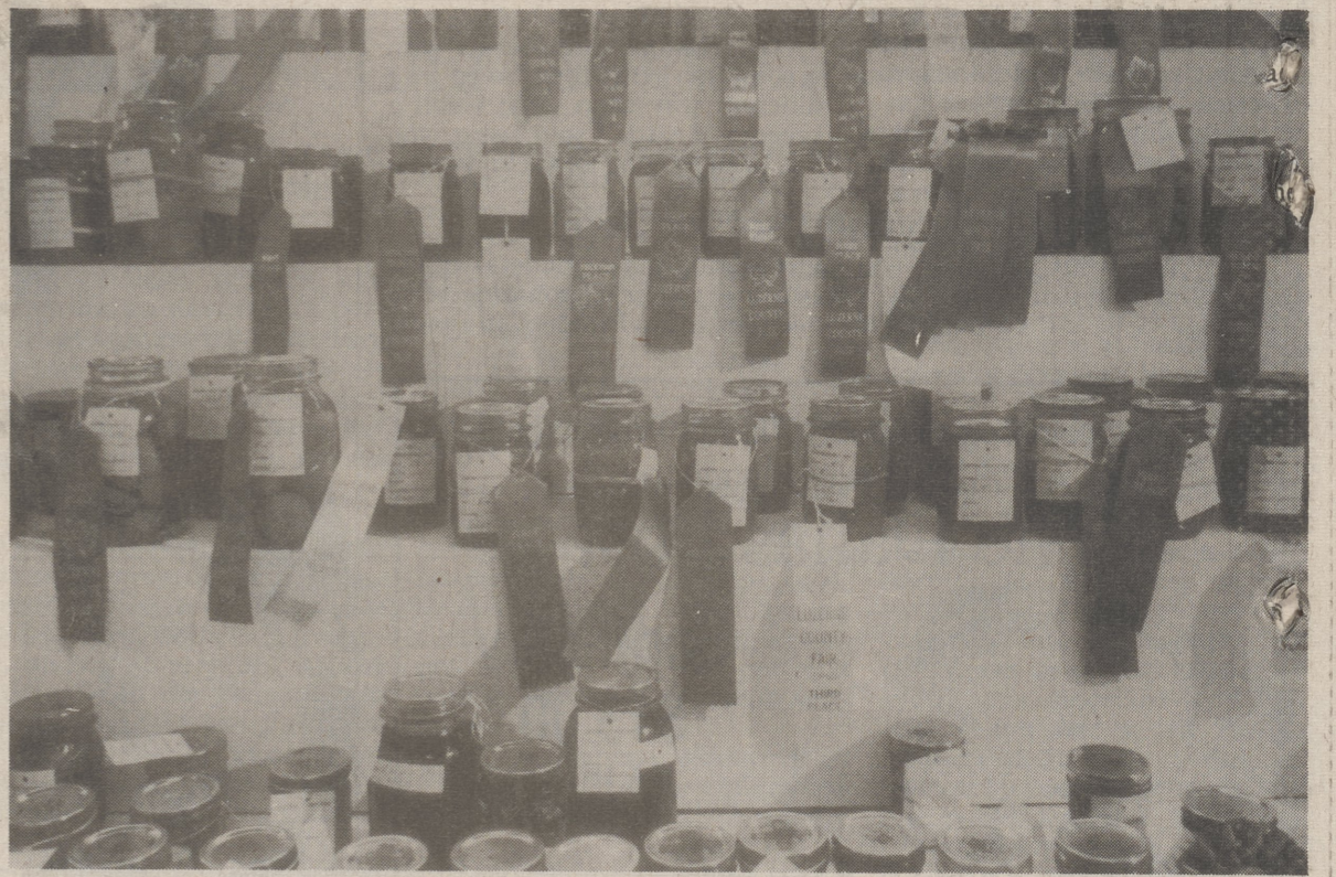
Tasty treats competed for ribbons.