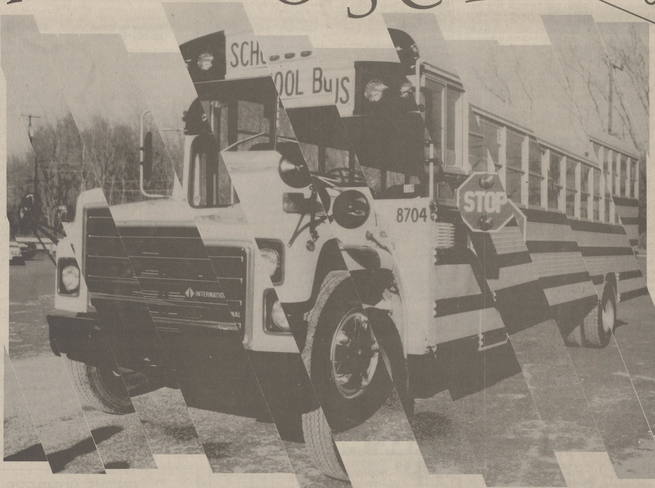
■ Dallas School Bus Schedules, pg 2