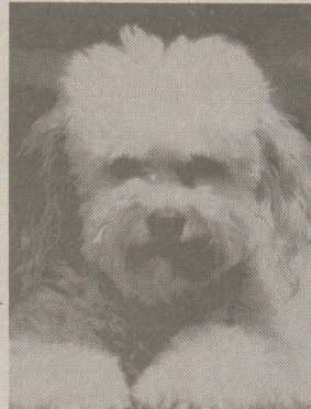
"Have a portrait taken of you and your pet or just your pet"

Package Includes: 1 - 5x7 Color Print 4 - 2x3 Color Wallet Prints