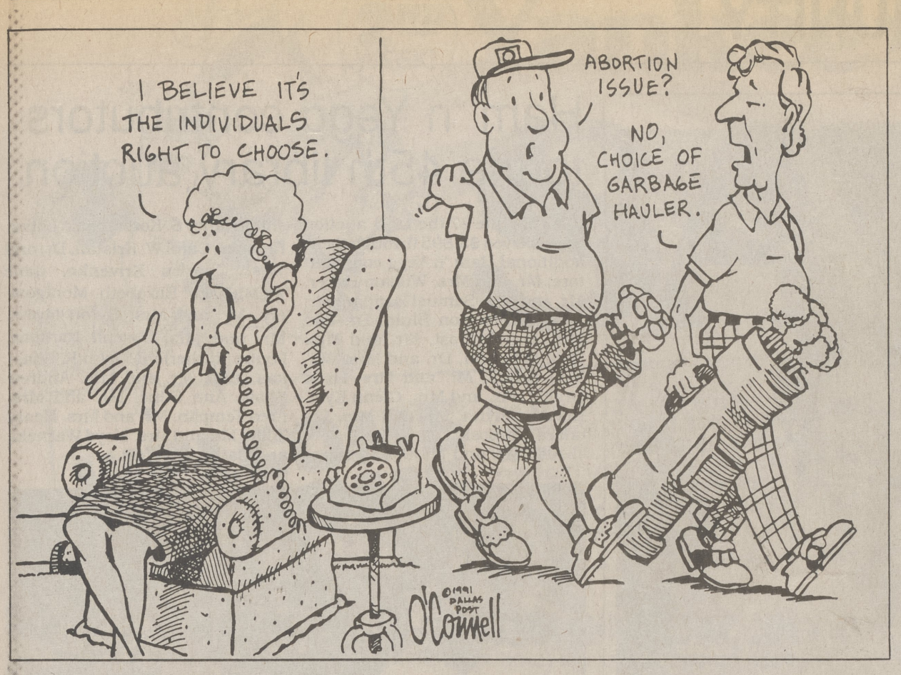
NEWS ITEM - Some Back Mountain residents feel that being required to use a designated garbage and recycling hauler is a violation of their rights.