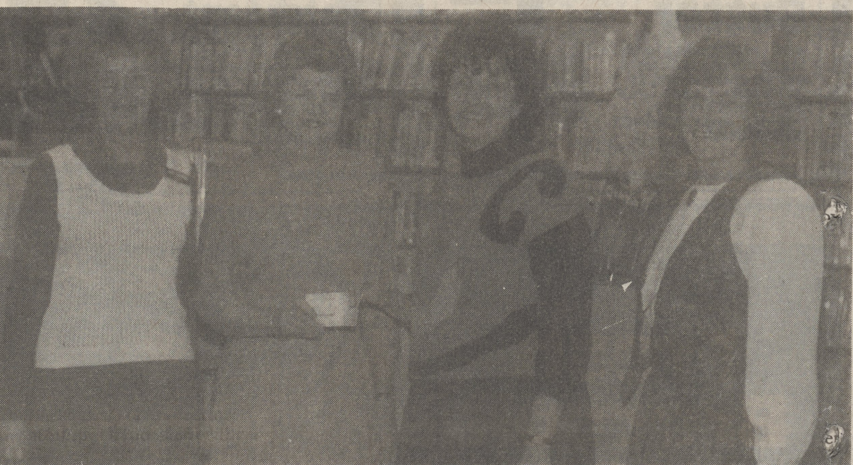
Women's Club makes donation to children's library

As in the past, luncheon will be available Tuesday evening.