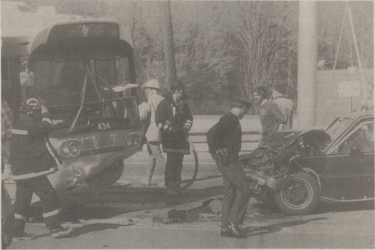
LOOKING OVER THE DAMAGE - Police and firemen inspect the damage of two vehicles involved in a four car crash on April 11 at the Intersection of Route 309 and Main St. in Dallas. No one was seriously injured in the accident that involved three passenger cars and a Luzerne County Transit Authority bus.