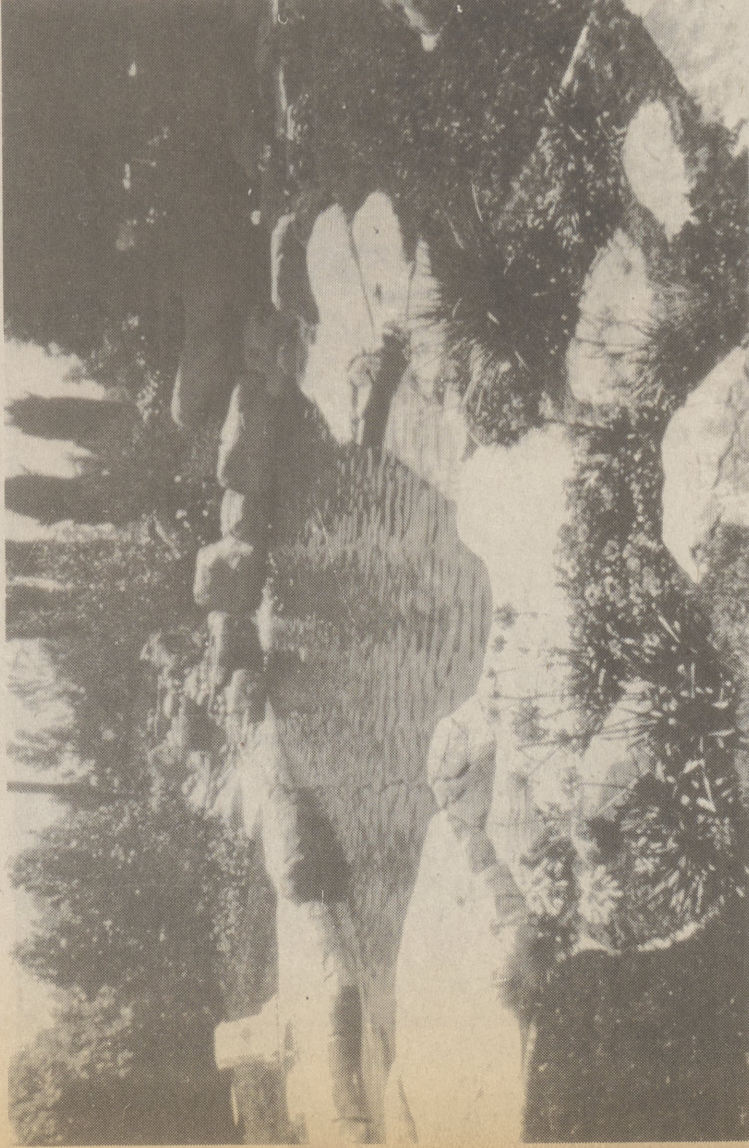
OUTDOOR ACCOUTREMENTS - Even swimming pools can be remodeled. A pool restoration can transform a standard rectangular pool into a backyard lagoon.

STEP WALLCOVERINGS, INC. ALTEP WHOLESALE WALLCOVERING SHOWROOM