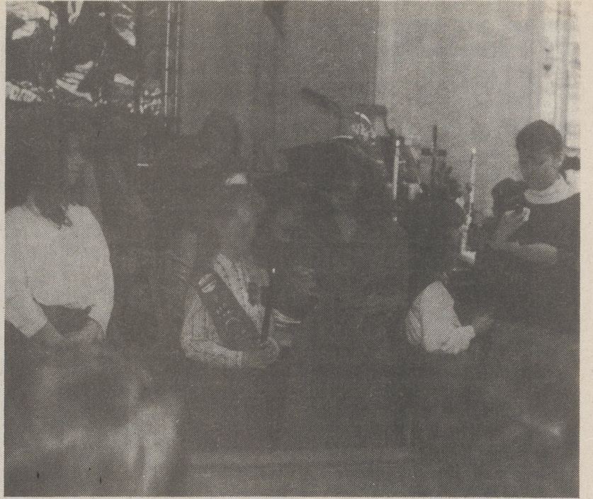
MARKING THE OCCASION - Girl Scout troops from Lehman joined together March 10 to note the 79th anniversary of Girl Scouting.

Dozens of N.E. PA businesses and organizations have again this year combined resources to provide a minimum $1,000 Cash Scholarship for the winner to be used at the college of her choice.