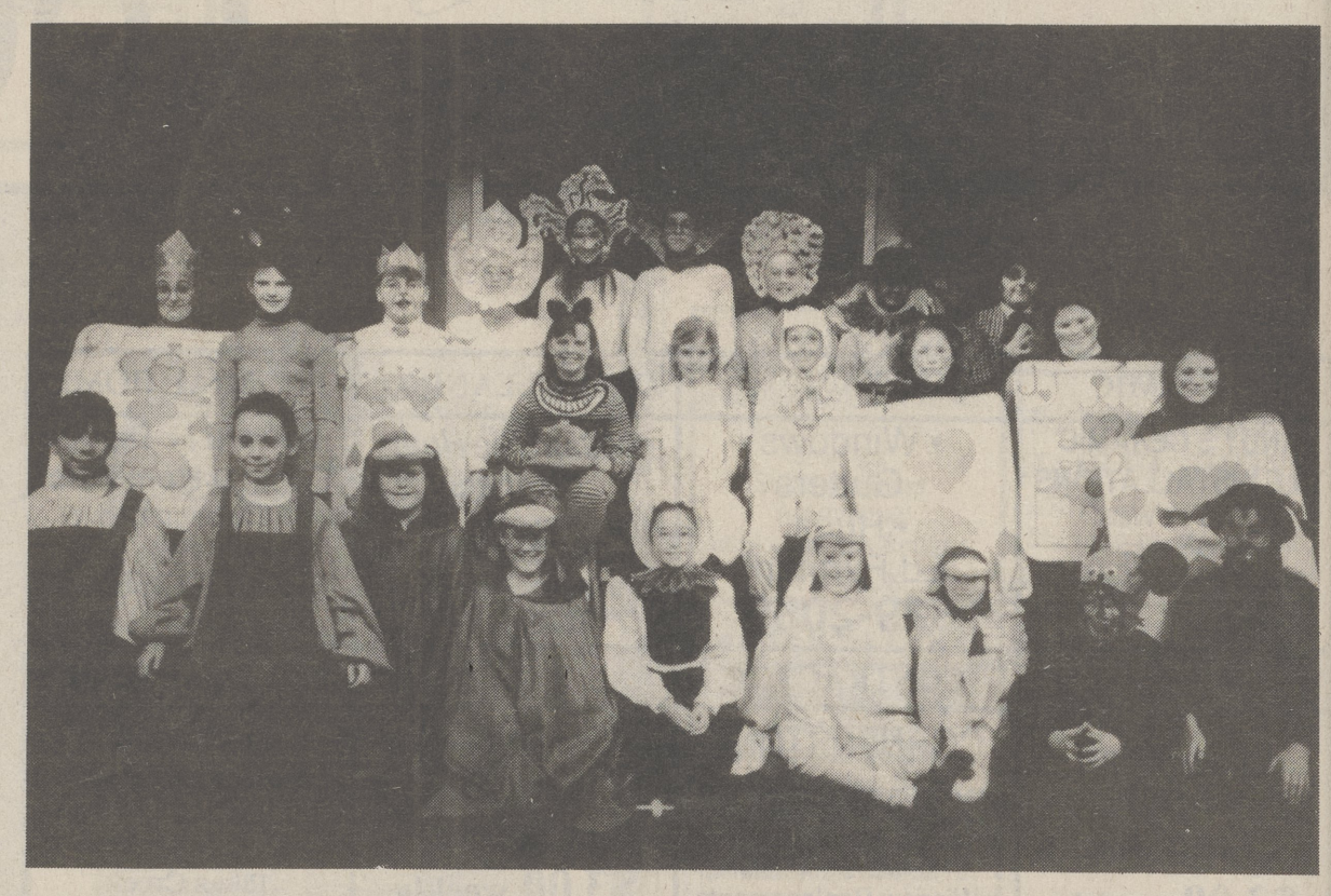
YOUNG PERFORMERS - Students from the 1990 Winter Worskshop at the Music Box Theatre are shown performing "Alice in Wonderland".

The Music Box Dinner Playhouse is located at 196 Hughes Street, Swoyersville, Pa.