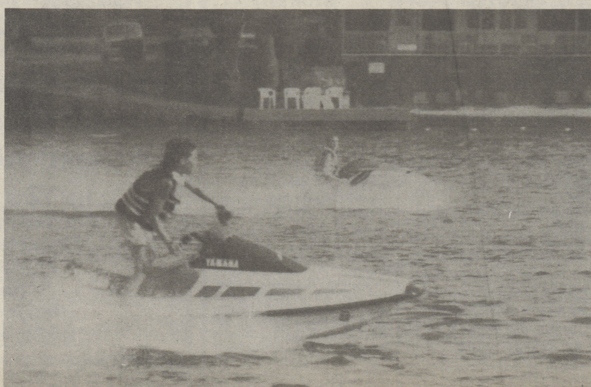
SKIING ON WATER - The popularity of jet skis has grown tremendously in recent years. Riders say they're fun and safe as long as boating rules are obeyed.

Jet skis are motorized float- See JETS, pg 5