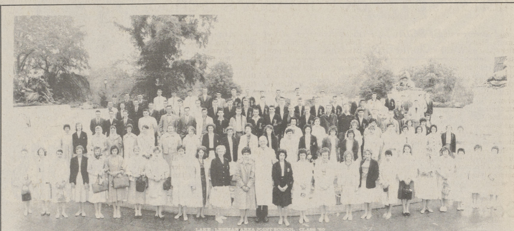
LAKE-LEHMAN AREA JOINT SCHOOL CLASS '60 WASHINGTON, D.C. MAY 1960