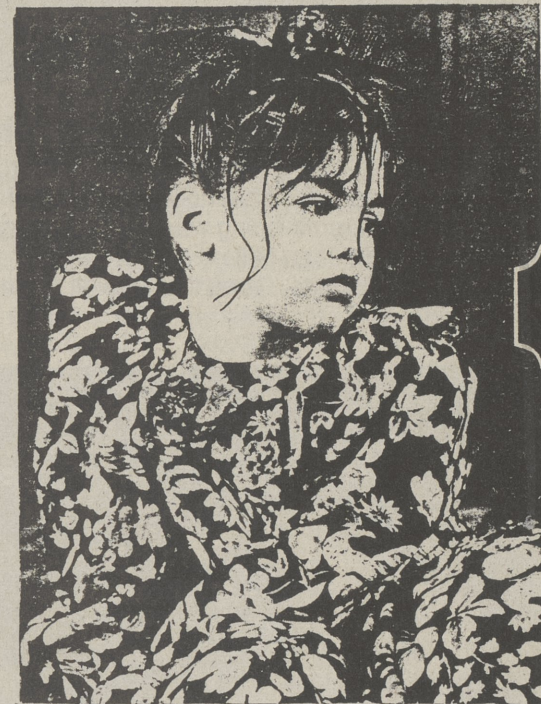
Créations Françoise Bouthillier Inc.