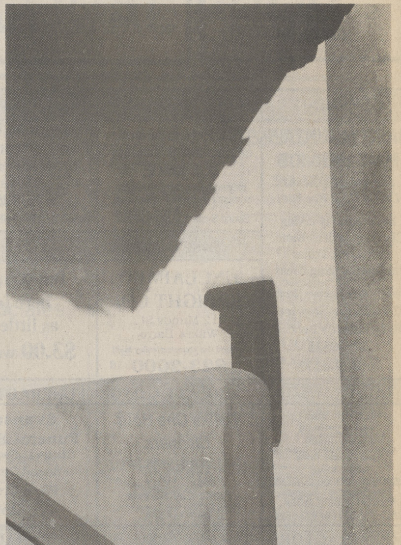
ON EXHIBIT AT MACDONALD GALLERY - Shown is "Shades of Grey" Santa Fe, 1989 by Mort Slavin. The work is on exhibit through August 5.

Looking for that unique reflection of his own point of view and tastes, Slavin strives for shots of subject matter and images taken from different vantage points. By invitation, his work has been shown at national photographic workshops in Soho, NY.