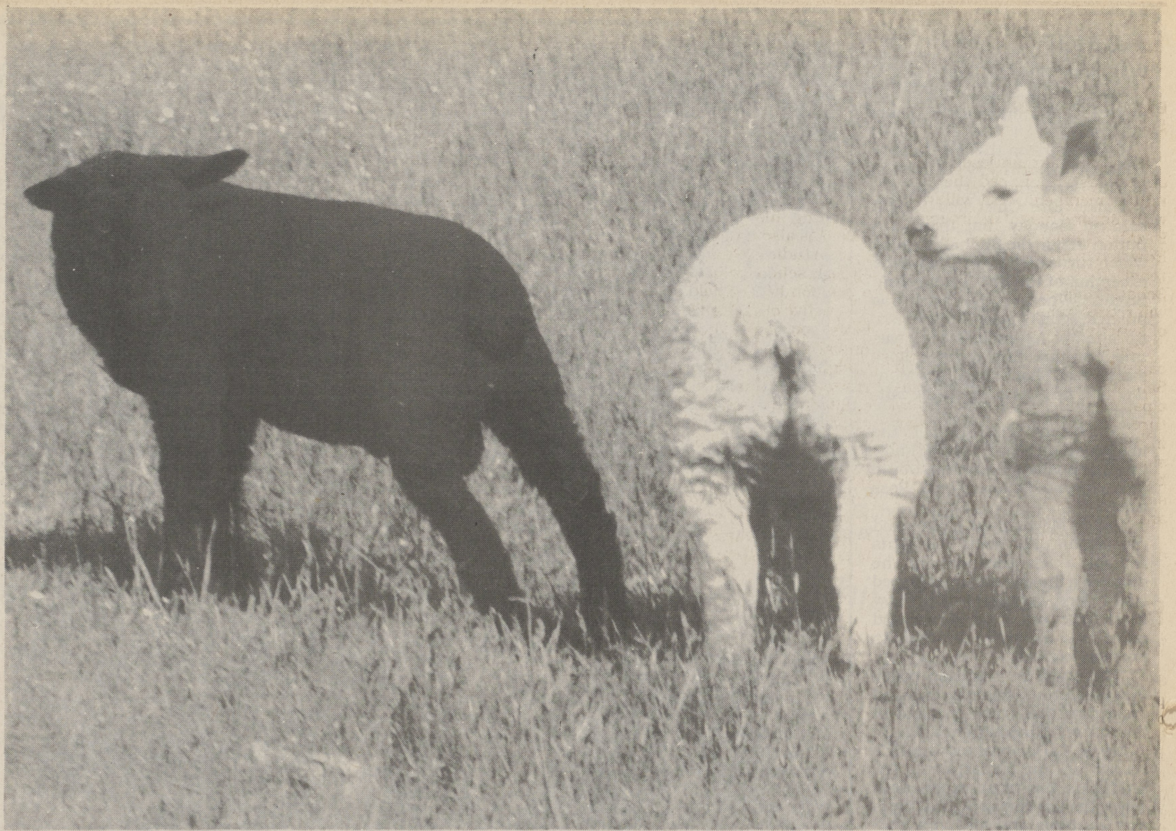
Black is beautiful

The Dallas Post encourages readers to share their opinions with the community by writing a letter to the editor. All letters for publication must be signed and include a telephone number so that we may verify authenticity. We will not publish anonymous letters. Send letters to: The Dallas Post, P.O. Box 366, Dallas PA 18612. Letters received by Noon on Monday may be included in that week's issue.