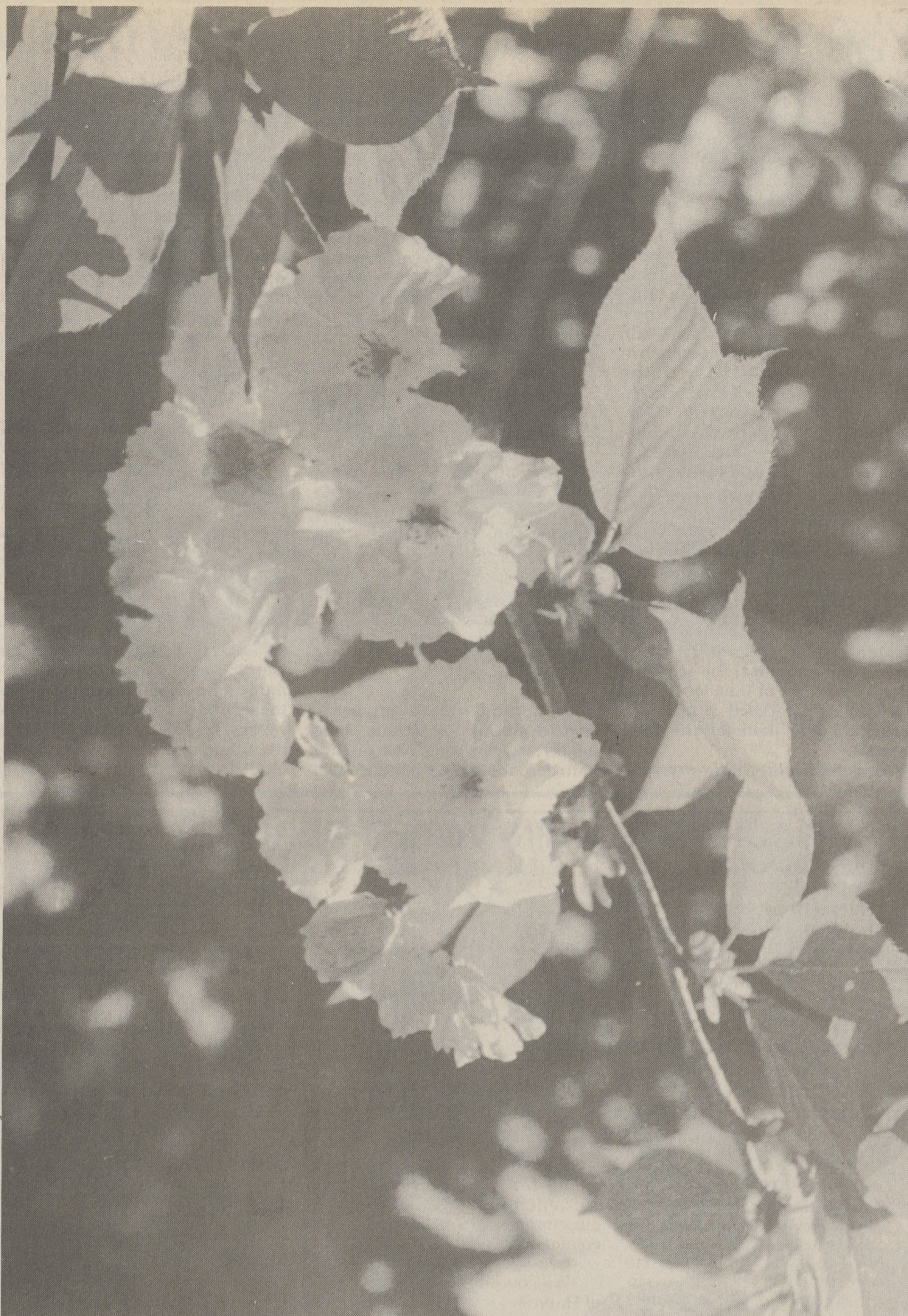
Cherry Bloom Time

MEMBER OF THE NATIONAL NEWSPAPER ASSOCIATION AND THE PENNSYLVANIA NEWSPAPER PUBLISHER'S ASSOCIATION