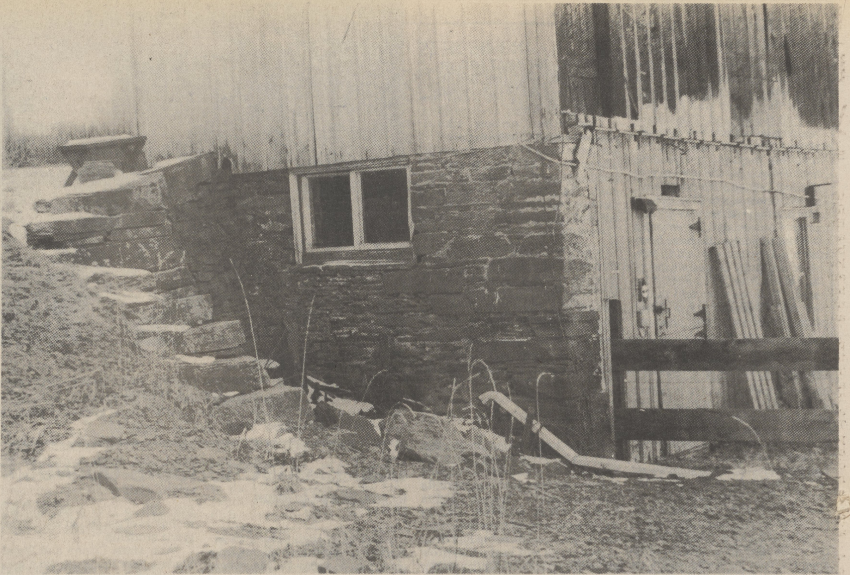
Step up to Spring