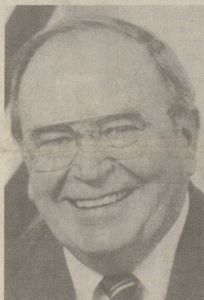
SEN. CHARLES D. LEMMOND