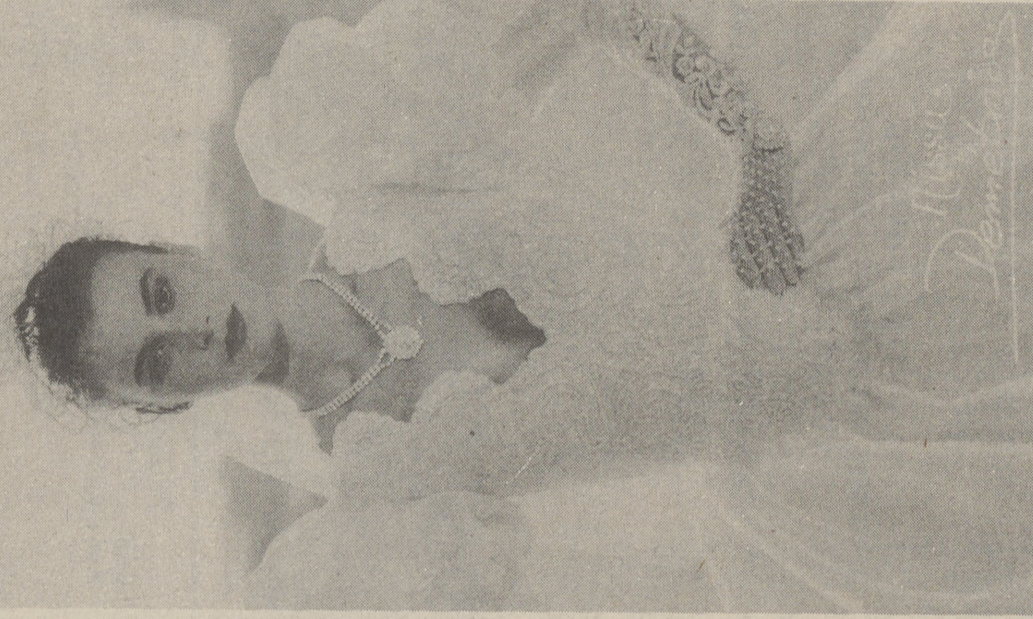
FLORAL FASHION - The right flowers add to the romance of any wedding. Shown above: This bride is wearing lilies of the valley in her hair, which are repeated in her cascade bouquet of stephanotis, gardenias, star of Bethlehem and lilies.