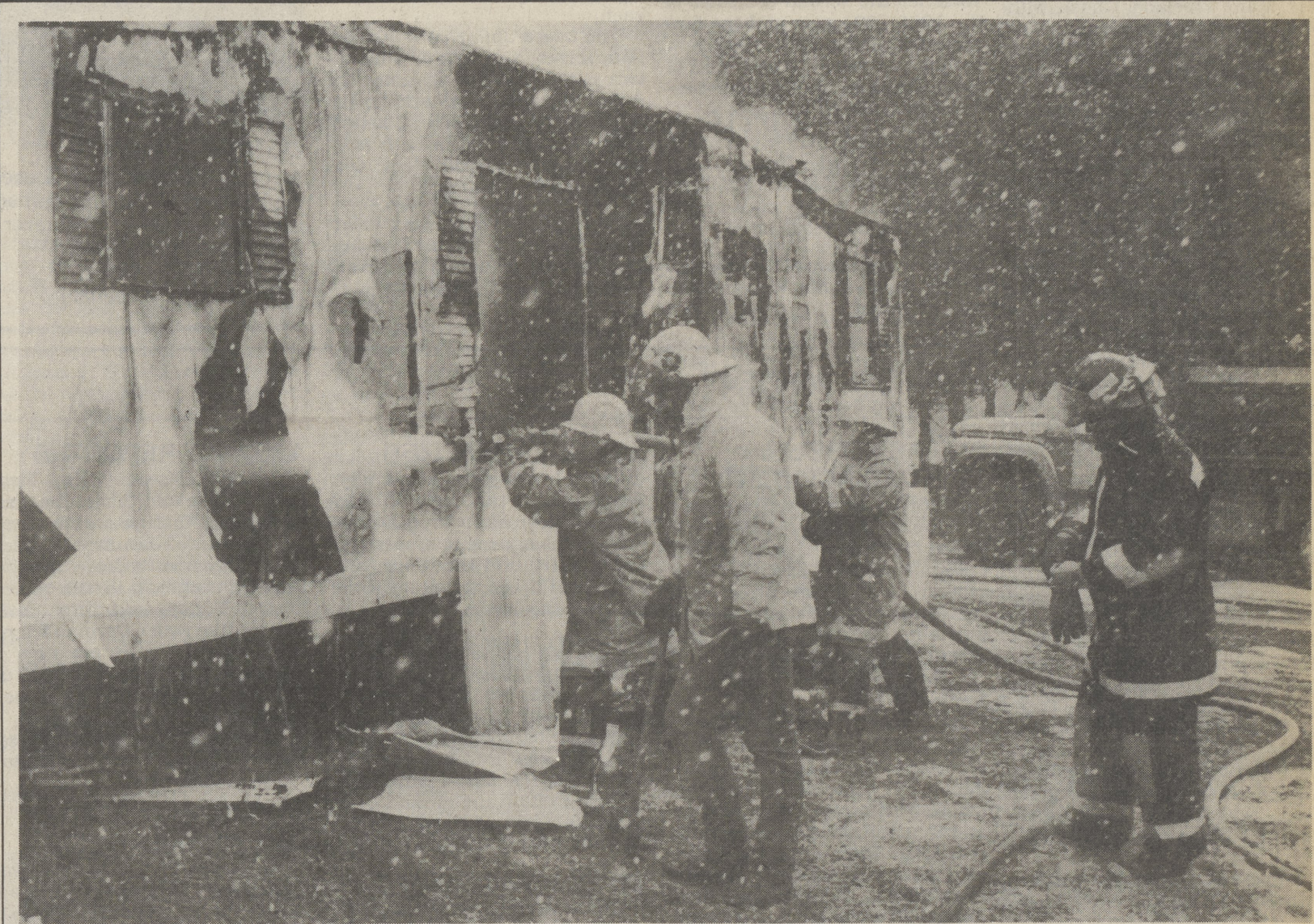
To no avail It was already too late when Back Mountain firefighters arrived on the scene of this trailer fire in Kunkle last week. The trailer and a car parked nearby were totally destroyed by the flames. It was the fourth trailer fire of the season.