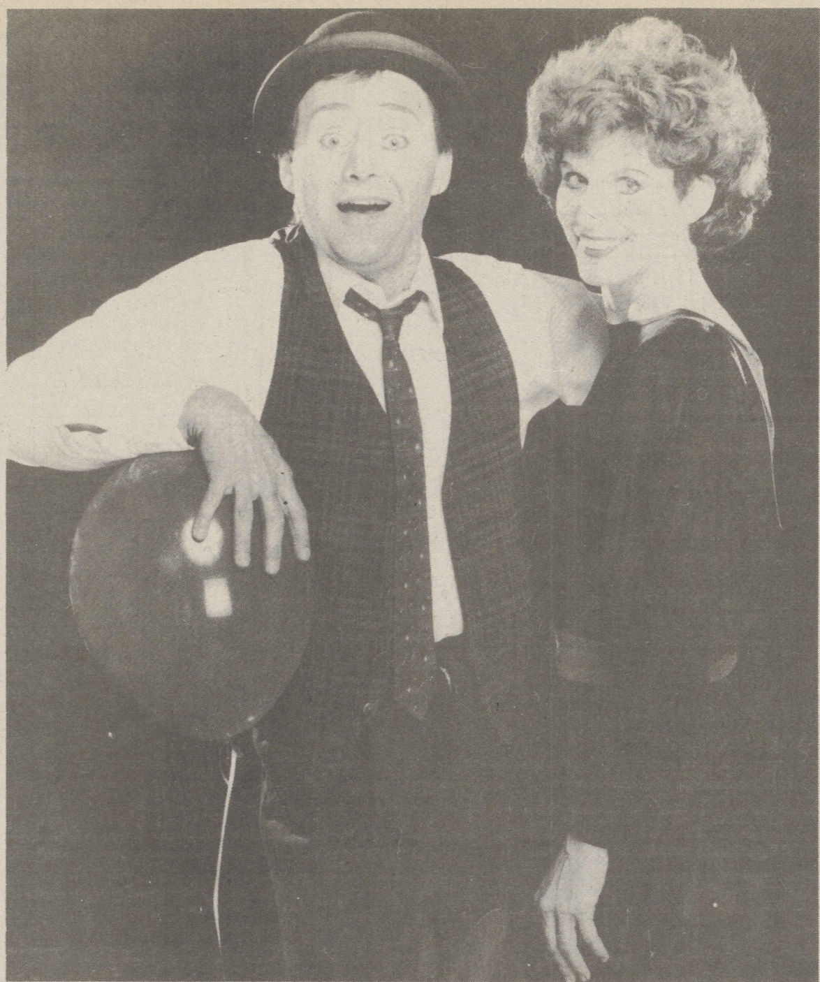
APPEARING AT PENN STATE SUNDAY

The Community Concert Association of Scranton 1989/90 season will include Los Romanos, a classical guitar quartet on Feb. 18, 1990; and the Pittsburgh Ballet Theatre on April 7, 1990. Subscriptions for the season and tickets for individual concerts are available through the Community Concerts office and may be obtained by writing or calling 404 N. Washington Ave., Scranton, 18503, 342-4137.