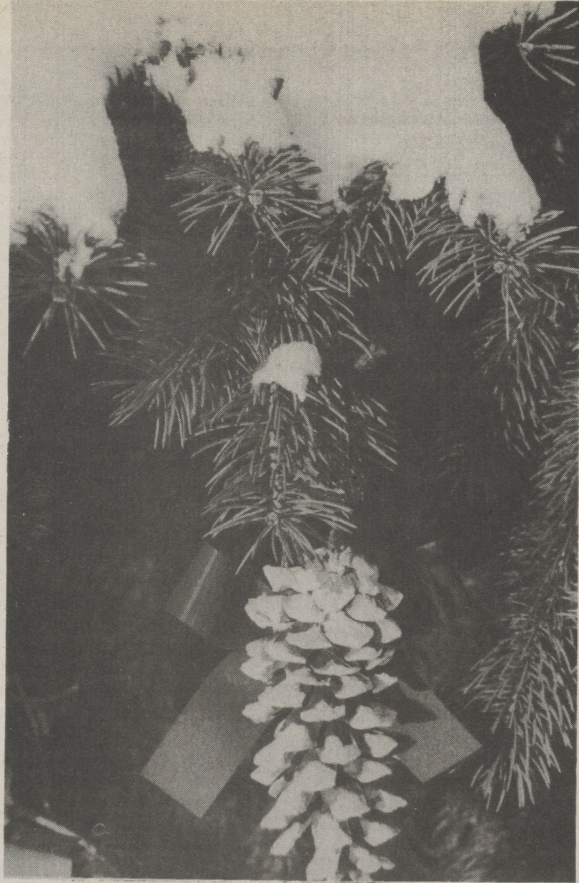
Gifts From Girl Scouts The decorations on the Dallas town tree are the handmade gifts of several Back Mountain Girl Scouts and Brownie troops.

While in recent years the holiday has tended to emphasize the military victory over the Syrians, it also stands as a reminder of the resilience of the Jewish people throughout the years, and the power of an oppressed people to rise up against tyranny.