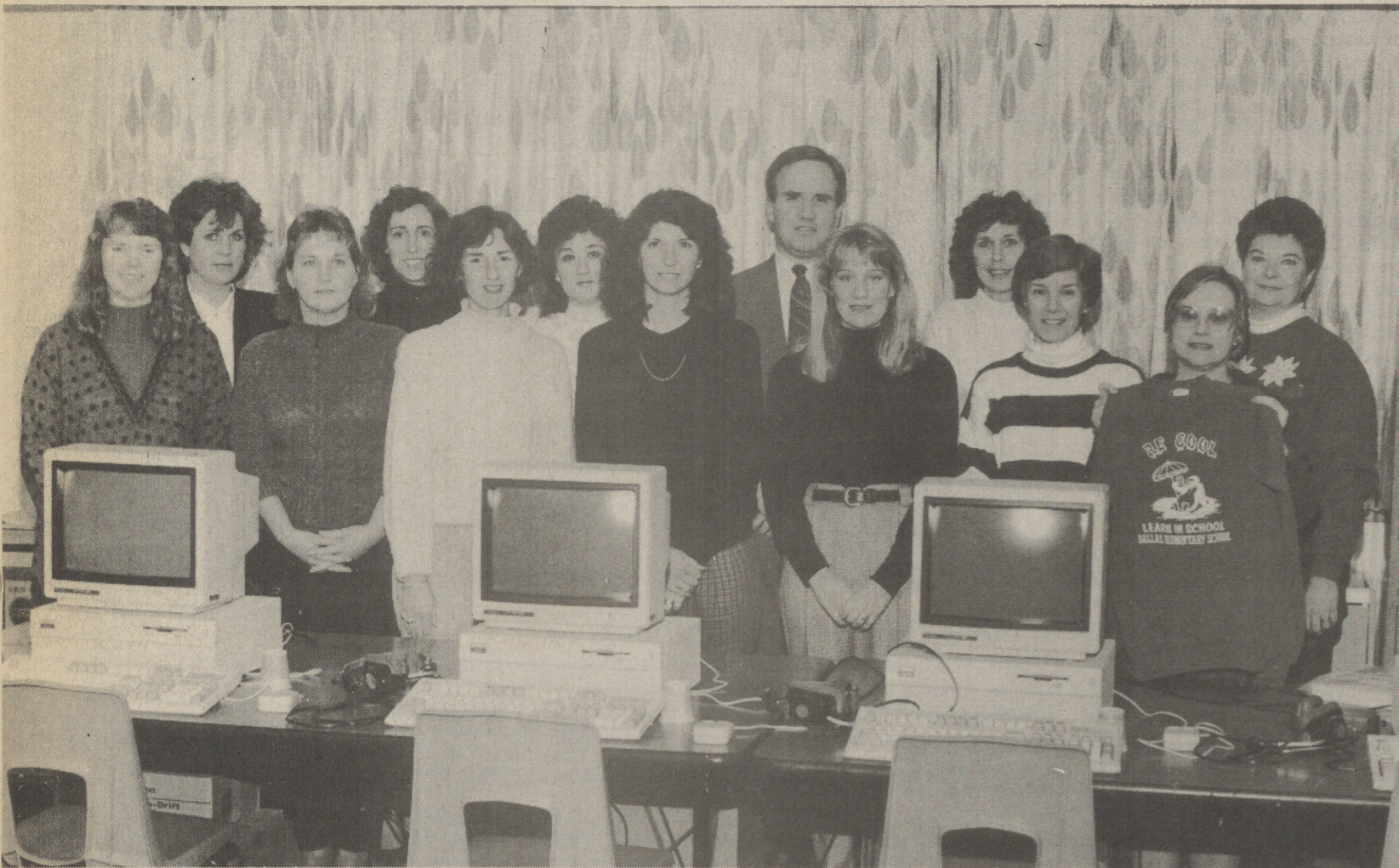
PTO DONATES COMPUTERS - Dallas Elementary PTO members pose with some of the computers they recently donated to the

school. The organization's donation to four computers brings to 28 the total number available at the school.