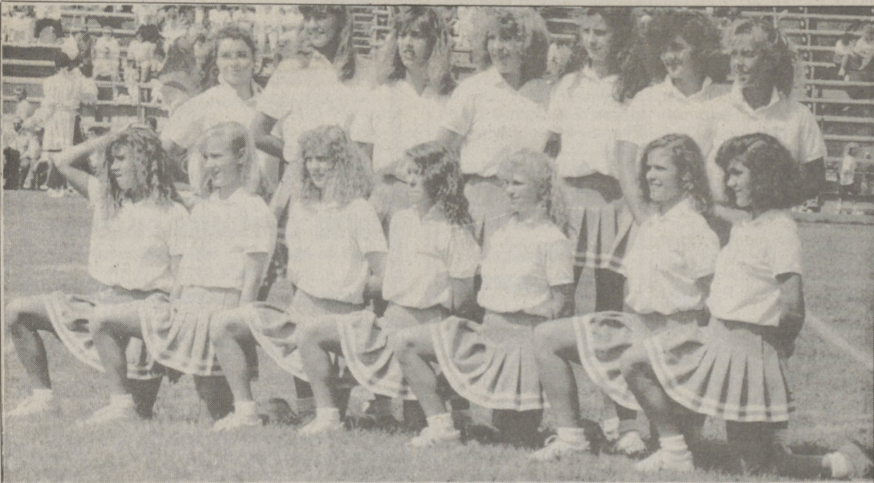
READY TO CHEER - Dallas cheerleaders get in formation at Saturday's game with Nanticoke as they get ready to cheer.