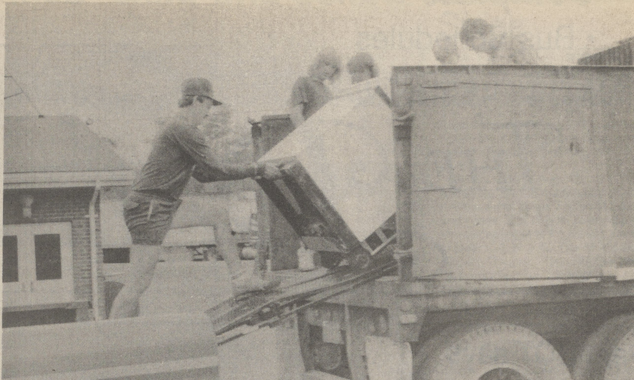
RECYCLING - An EVAC volunteer helps a family to load large appliance into a recycling trailer on Saturday. EVAC held the recycling drive to help clean up roads and fields.

Burial was in Memorial Shrine Park, Carverton.