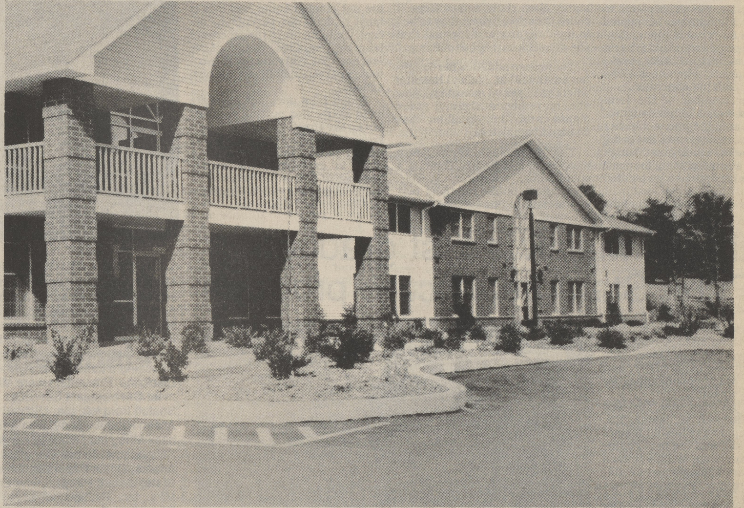
HI-MEADOWS - The exterior of Hi-Meadows Apartments is beautifully designed highlighted with white trim and featuring ground to ceiling cathedral-type windows.

The new Hi-Meadows Apartments bring to completion an attractive, interconnected complex for the convenience of the residents in the area between Route 415 and the Old Lake Road, Dallas.