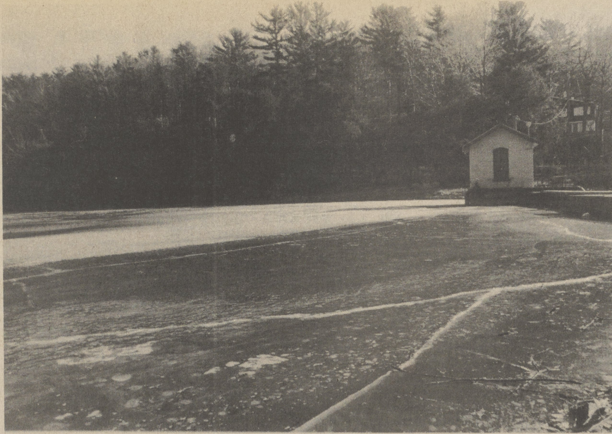
Ice is in Ice formed on many ponds and lakes last week. Here, Huntsville Dam lies ice-covered.

Arthritis Clinic will be conducted by Nesbitt Memorial Hospital on