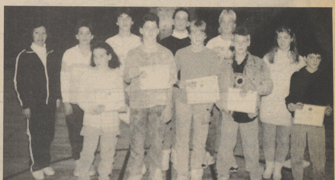
Dallas Middle School PhysEd winners