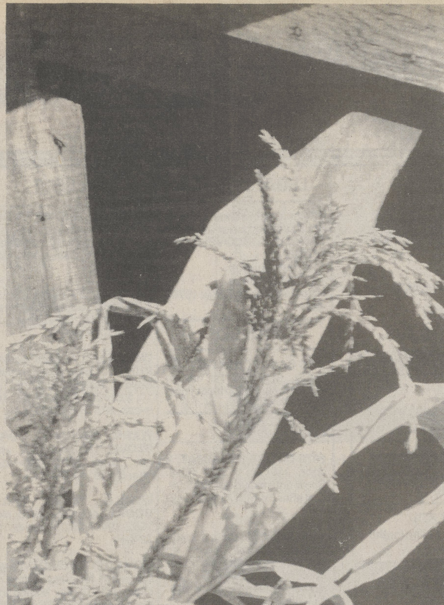
Tassel of corn