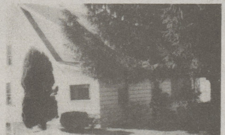
9 Stone Moss Dr., Woodridge, Shavertown

Two-story, 8 room 3-4 bedroom home w/modern eat-in kitchen, 2 baths, gas heat. Stream runs through large lot.