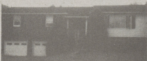
31 Forest Dr., Applewood Manor, Dallas

Need space for your growing family? See this large raised ranch in prestigious area. 3 or 4 bedrooms, 2 1/2 baths, 16'x20' LR, DR, eat-in kitchen. Lovely family room w/fireplace. Big 2-car garage.