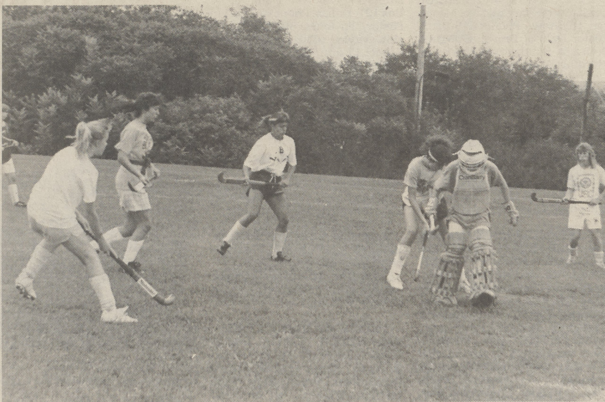
GETTING READY —Members of the Dallas High School field hockey team practiced last week to prepare for the coming season.