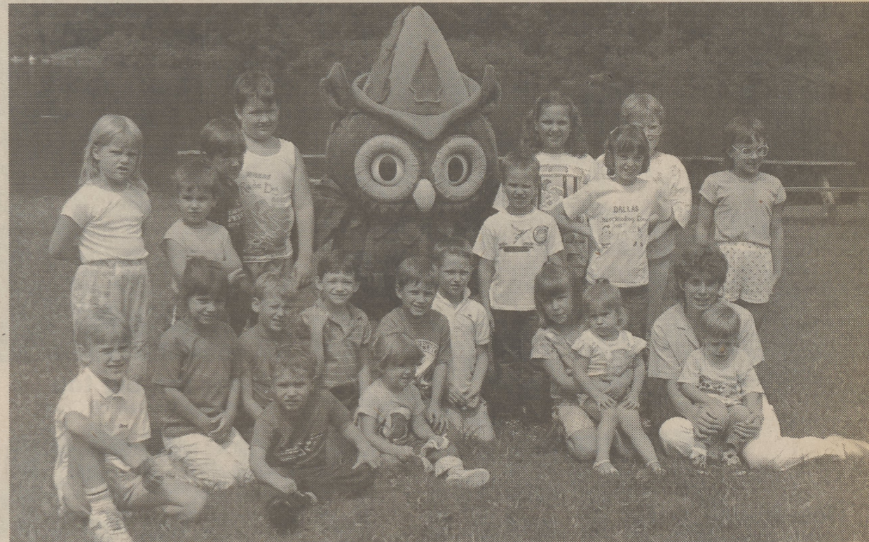
WOODSY OWL VISITS—Some of the children who attended the Environmental Day Camp at Francis Slocum Park, and Woodsy Owl.