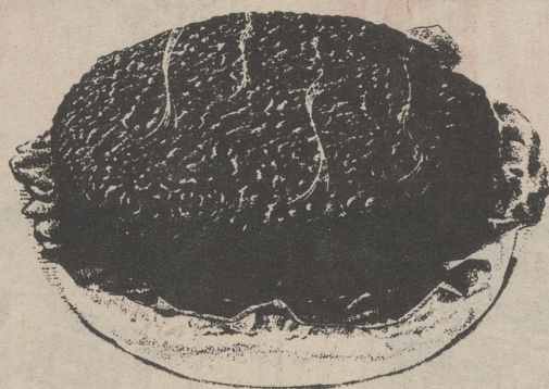
Fresh Ground Chuck