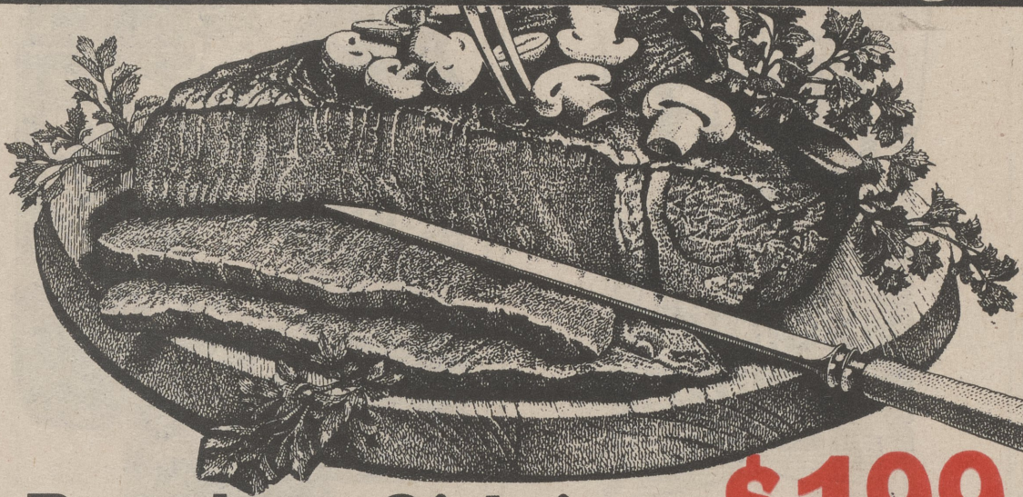
Boneless Sirloin Tip Roast