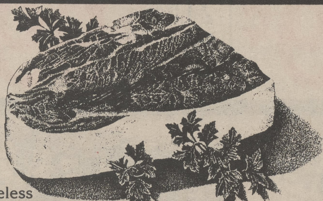
Boneless Chuck Steak or Roast