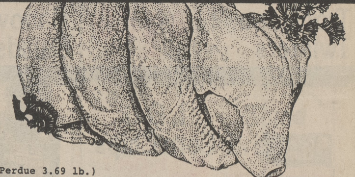
(Perdue 3.69 lb.) Boneless & Skinless Chicken Breast