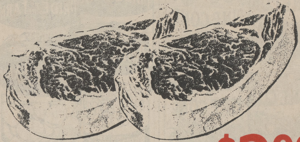
Boneless N.Y. Strip Steaks