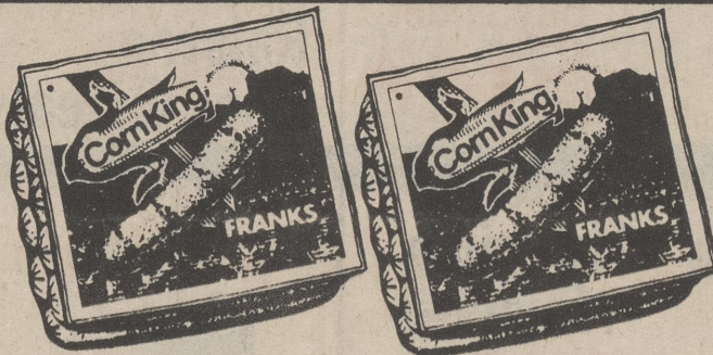
1-Lb. Pkg.—Wilson Corn King Franks