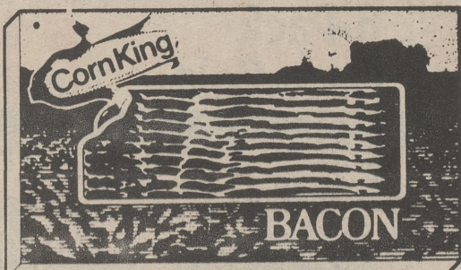
1-Lb. Pkg.—Wilson Corn King Bacon