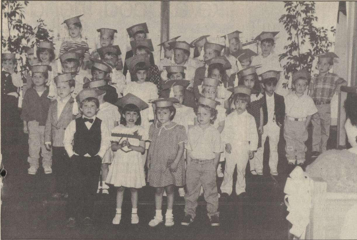
YOUNG GRADUATES — Members of the graduating class at Trinity Nursery School, Dallas