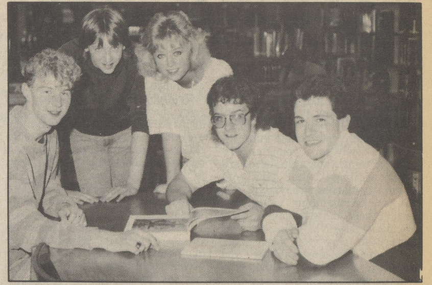
BACK FROM FIELD TRIP — Dallas HS students finish special studies

Transportation to the Job Corps Center, dormitories, meals, books and tuition are also free. A small spending allowance and a readjustment allowance are also provided. College applicants must be enrolled at a Job Corps Center 30 to 90 days before college starts.