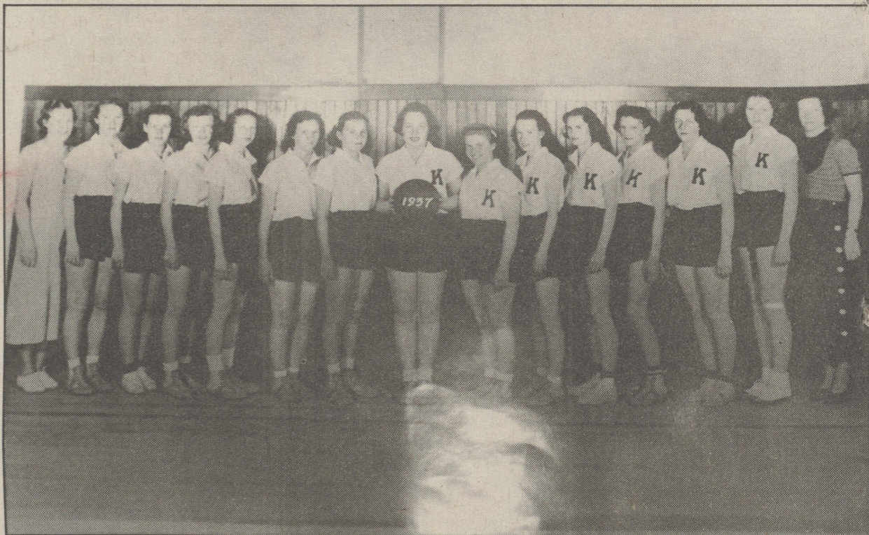
THEN — Some of the same women are shown on a 1937 girls' basketball team photo taken in 1937 when they would have been juniors at the high school.