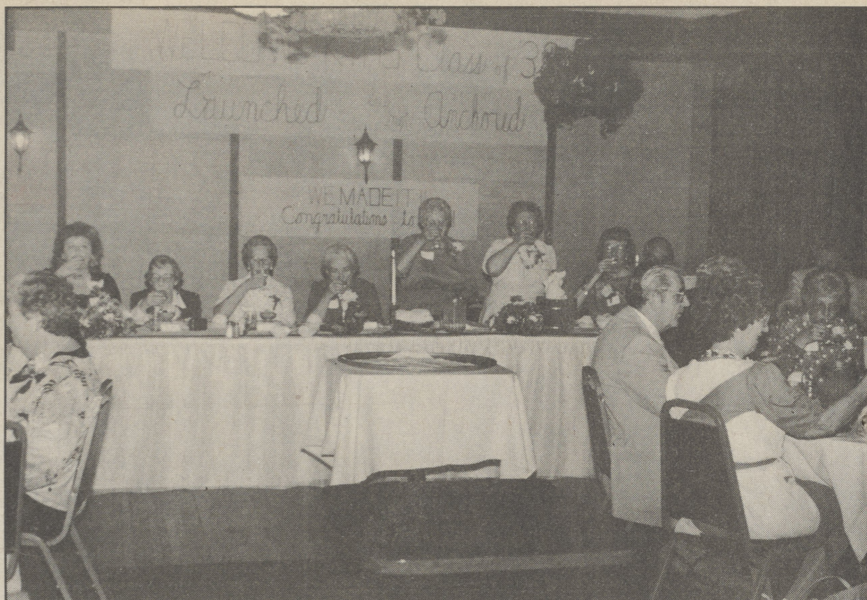
NOW — Officers of the Kingston Township High School Gaudtaing Class of 1938 toast their classmates who attended their 50th class reunion. Thirty members of the class and their spouses attended the gala event.

A display of memorabilia, newspaper articles, headlines and ads were available for observation and conversation.