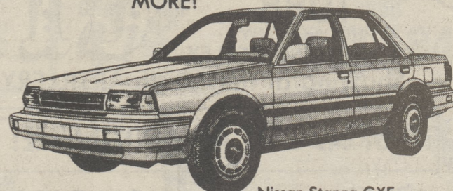
Nissan Stanza GXE

SIMILAR SAVINGS ON ALL STANZA AND STANZA WAGONS!