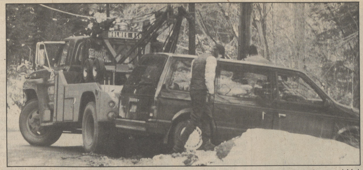
CAR HITS LEDGE - Two people were injured in this one car accident off Pioneer Ave. and Main