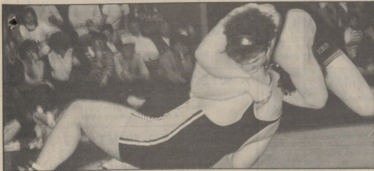
DALLAS MATMEN GO DOWN FIGHTING — Tunkhannock wrestlers defeated the Dallas Mountaineers Saturday on the Tigers mats but the Dallas wrestlers fought hard for a win. Above, the wrestlers from both schools fight tough to gain the win but in this bout, Tunkhannock came out on top.