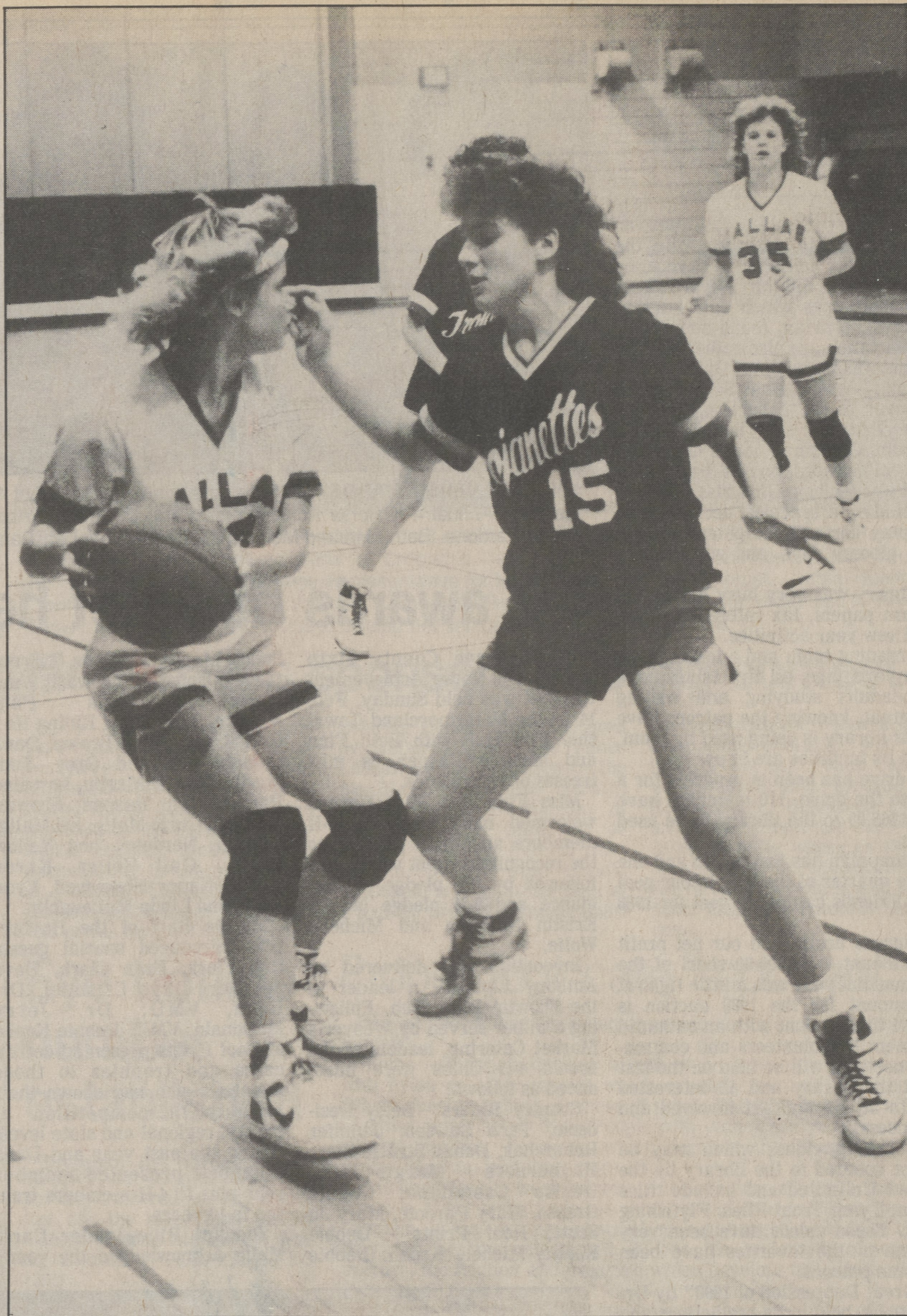
STILL TRYING — Despite a disappointing start to the second half of the basketball season, the Lady Mountaineers of Dallas are still playing aggressive ball.