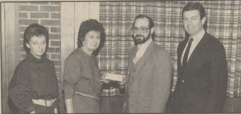
SEM AUCTION NETS $21,000 — A 15 year-old tradition at Wyoming Seminary helps fund many activities

More information on any of the Homecoming activities can be obtained by contacting a staff member of the King's Alumni Office at 826-5879 from 8:30 a.m. to 4:30 p.m.