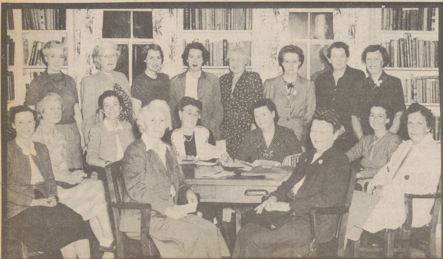
1950 — In 1950, the auction's solicitation committee was comprised of these hard-working women.