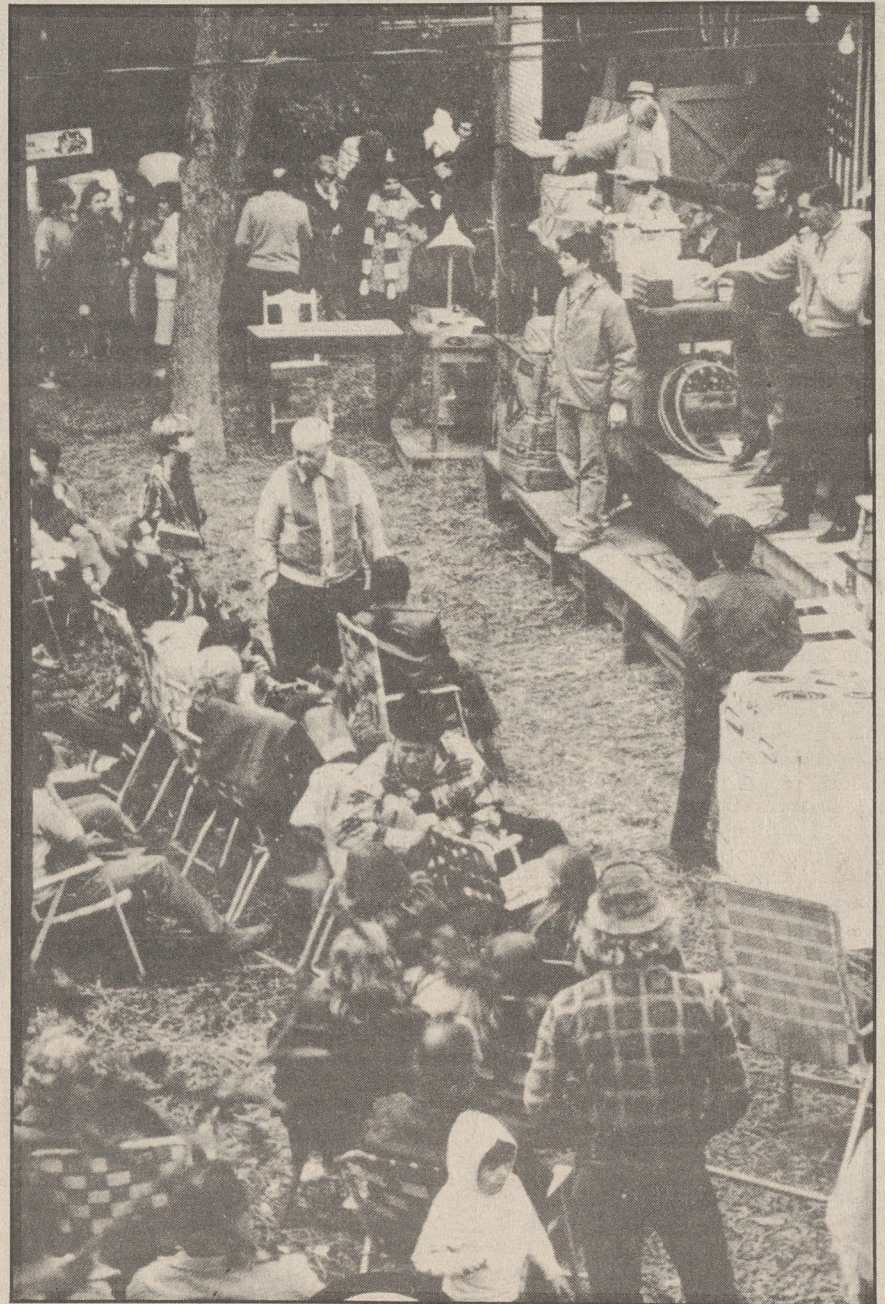
WORKING THE CROWD — Auctioneers work the crowd at a Back Mountain Memorial Library Auction of years ago. Notice how closely the auctioneers work together during the fund-raising event.