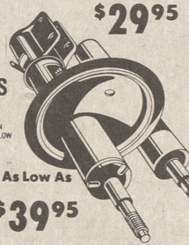
As Low As $29 95

MONROE Best Ride Sale SPECIAL SAVINGS plus a cash-back bonus! Get a Mail-in $10 00 CASH BONUS when you buy a pair of Gas-Matic® struts or cartridges