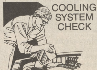
COOLING SYSTEM CHECK