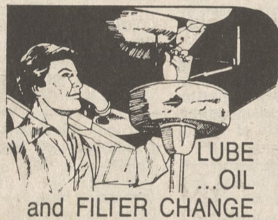
LUBE ... OIL and FILTER CHANGE