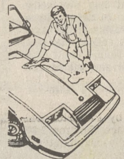
WASH AND WAX