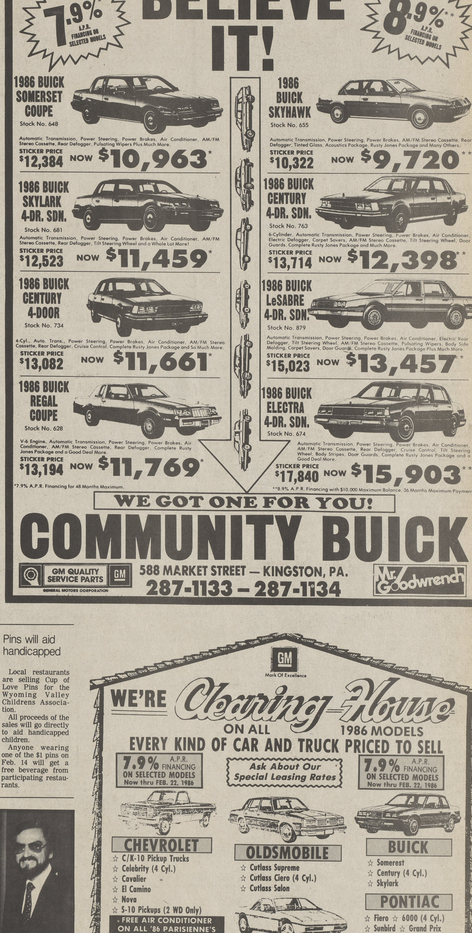
THE DALLAS POST/Wednesday, February 12, 1986 19

tilt wheel, new battery & tires. 40,000 miles. Parked 5½ yrs., $4,000. 829-3318. 5-4-GR