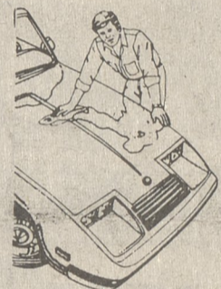
WASH AND WAX