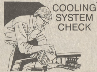
COOLING SYSTEM CHECK