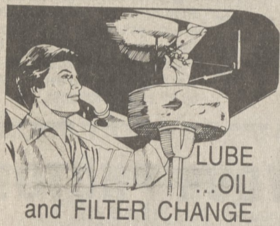
LUBE ...OIL and FILTER CHANGE