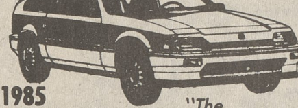
1985 HONDA CRX "The Pocket Rocket"

HERE ARE TWO EXAMPLES OF OUR HIGH QUALITY LOW MILEAGE USED CARS.