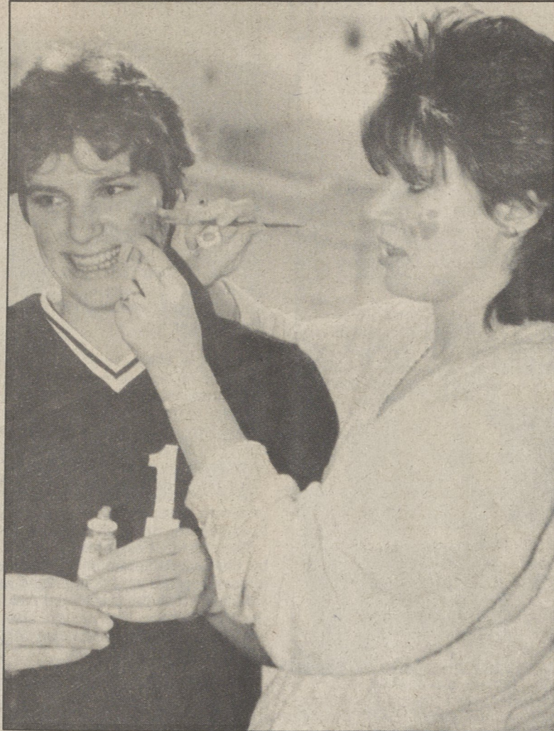
Painting paws A Misericordia student takes time out from Friday night's activities to paint the new college emblem, a cougar's paw, on the face of a classmate. The local college changed its nickname from Highlanders to Cougars.