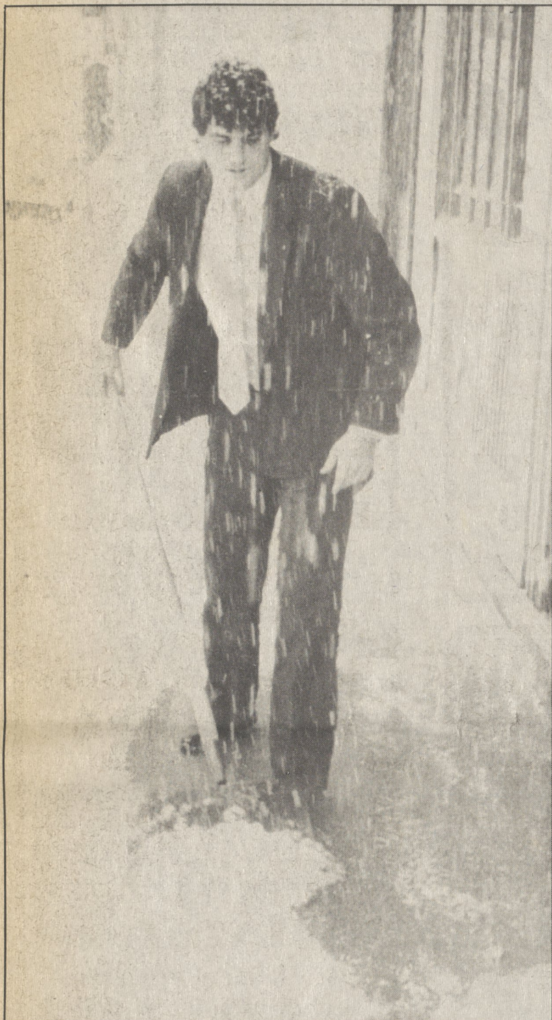
Dallas Post/Ed Campbell